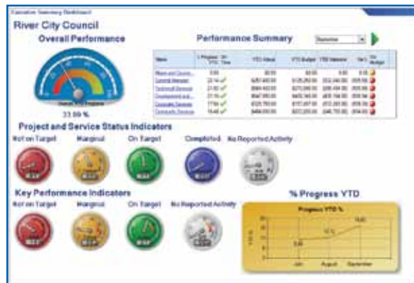
The unique TechnologyOne dashboard personalises the user experience. Through a series of easy to identify traffic lights, problems are quickly highlighted and can be dealt with instantly.

As part of the strategic feedback loop and ongoing planning cycle, organisations undergo a benefits realisation analysis. This performance "post mortem" provides the organisation with an opportunity to understand the causes of under or over-achievements, and apply that knowledge to the future. TechnologyOne Performance Planning highlights these variances and ensures that this knowledge is captured together with associated recommendations for input into the next planning cycle.