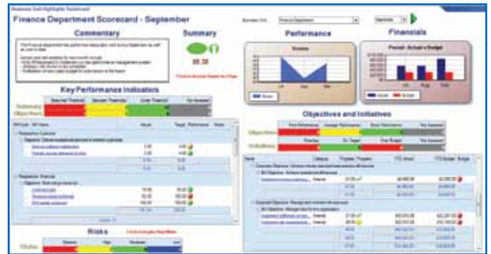
TechnologyOne Performance Planning enables you to strategically define your organisational goals by business unit.

Performance Planning integrates with other TechnologyOne solutions so that relevant data is automatically extracted and updated.